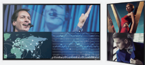
Figure 3. Split-screen display capabilities offer myriad usage scenarios.