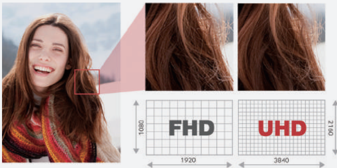
Figure 2. UHD high pixel density provides accurate detail representation.

QMD Series delivers four times the FHD resolution on the same screen area, resulting in the most accurate recreation of details possible. Text that displays on QMD Series in UHD is super-crisp due to its high pixel density. High-detail visuals, such as photos and videos, are visible with the smallest details for a hyper-realistic and immersive visual experience.