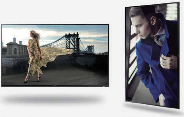
Figure 4. Pivot mode to fit the aesthetic setting while delivering dynamic content.

To meet the demands of traditional commercial environments, digital signage is often installed in portrait mode. Thus, it is critical that the digital signage supports portrait installation to fit to the aesthetics of the setting while still delivering the dynamic qualities of digital signage. QMD Series offers pivot mode that allows them to be installed in either landscape or portrait orientation to suit the environment's needs.