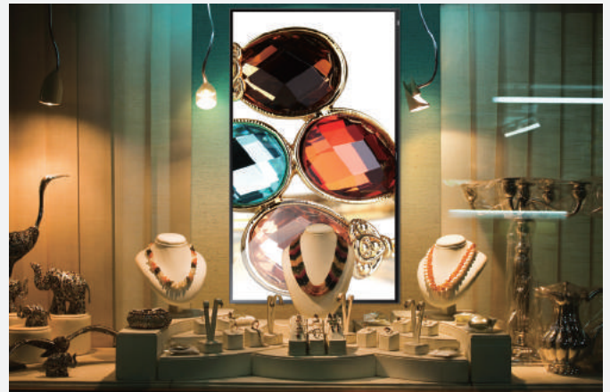
Figure 1. Commercial applications can leverage QMD Series clarity and operational capabilities.

Samsung QMD Series SMART Signage features a new design and delivers 3,840 x 2,160 resolution, multi-format PIP support, DP 1.2 support, set-back box (SBB) support, portrait or landscape orientation and reliable 16/7 operation for amazing flexibility and picture clarity in commercial settings. For example, retail stores can leverage Samsung QMD Series with UHD to improve their brand image and showcase products in sharp detail, while corporations and arena or museum security centers can use the high-resolution displays to enhance security with stable and vivid content playback.