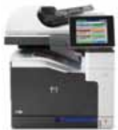
(HP LaserJet Enterprise 700 Printer M775dn)