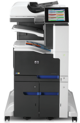
(HP LaserJet Enterprise 700 Printer M775z+)

Mobile printing capability: 3 HP ePrint, Apple AirPrint™