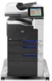
(HP LaserJet Enterprise 700 Printer M775f)