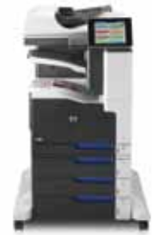
(HP LaserJet Enterprise 700 Printer M775z)