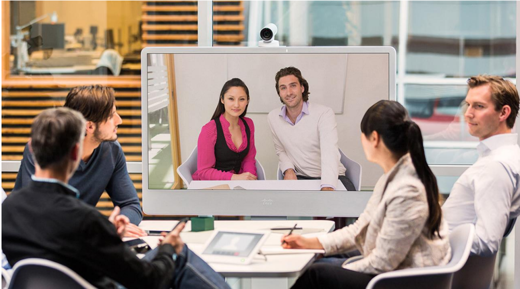
Figure 2. Cisco TelePresence MX300 G2 on Floor Stand

The Cisco TelePresence MX300 G2 and MX200 G2 are part of a complete collaboration ecosystem that offers high-quality, easy-to-use telepresence experiences that you have come to expect from Cisco, together with rapid global service and price-performance that make broad deployment easier and more affordable than ever. Whether you are just getting started with video communications or are planning to video-enable your entire organization, the MX300 G2 and MX200 G2 can meet your needs.