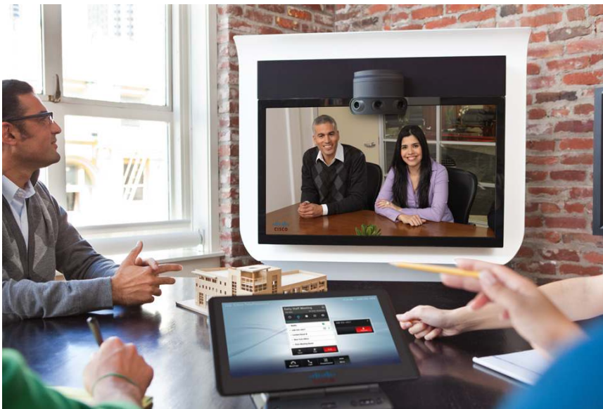
Figure 1. Cisco TelePresence System TX1300 47

The TX1300 family comprises the TX1310 65, featuring a 65-inch screen, and the TX1300 47, which offers a 47-inch screen. With crisp video resolution of up to 1080p60* (1080 pixels displayed at 60 frames per second), high-definition 1080p30 content sharing, premium audio quality, and the convenience of features such as “one-button-to-push” calling, the TX1300 Series delivers the high-quality experience expected of Cisco® immersive telepresence rooms. With an innovative combination of triple-camera cluster and voice-activated switching technology, the TX1300 Series enables up to six participants to have a face-forward seat at the virtual table through a single video stream. Integrated audio conferencing and presentation-sharing capabilities make this solution a powerful team telepresence solution that enhances collaboration in many ways.