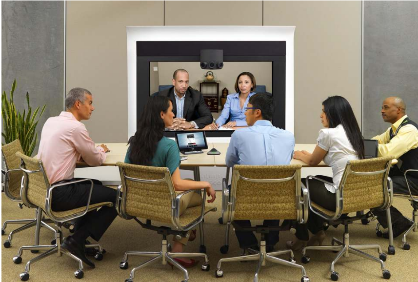
Figure 2. Cisco TelePresence TX1310 65